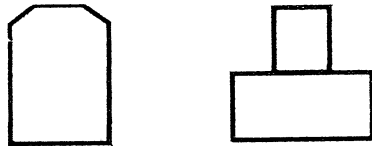
Incorrect Mold Geometry